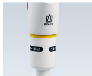
Integrated shaft coupling