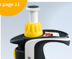
Easy Calibration technology