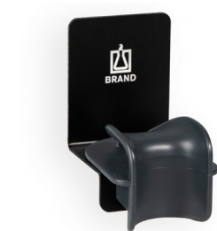
Wall mount for 1 Transferpette® S single- or multi-channel pipette.