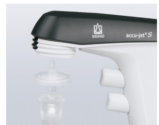
Membrane filter and check valve prevent liquid penetration