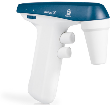
accu-jet® S, color: petrol

Precise pipetting of large and small volumes is simple due to single-handed control of pipetting speed for fast, powerful aspiration, accurate meniscus setting, or precise dispensing of small volumes. Thanks to the precise control, you always achieve the required volume spot-on when working with graduated or bulb pipettes. If you need extra power or precision, motor speed is controlled on the fly with one hand. Choose between gravity-delivery (for pipettes calibrated "to deliver") or powered blow-out delivery (for pipettes calibrated "to contain").