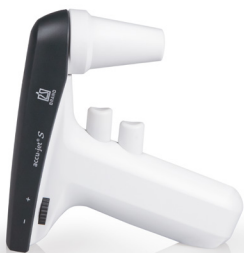
accu-jet® S, anthracite