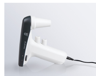
Smart charging technology prevents lazy battery effect