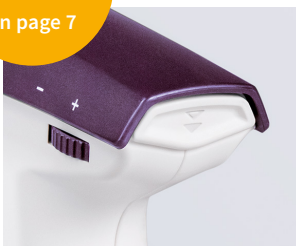
Gravity delivery or blow-out with motor power