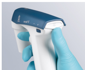
Efficient single-handed operation