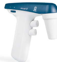
accu-jet® S, petrol