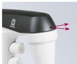
Direct outlet of sample vapors