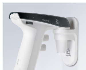
Wall mount for space-saving storage