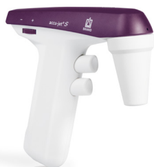
accu-jet® S, berry