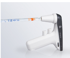
Rest position with inserted pipette

The battery is fully charged in just 4 hours. Working during the charging process is also possible with the charging cable connected.