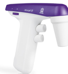
accu-jet® S, amethyst